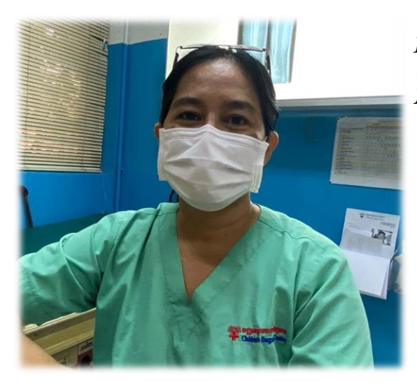
International Nurses Week May 12, 2021, recognized several of our nursing staff